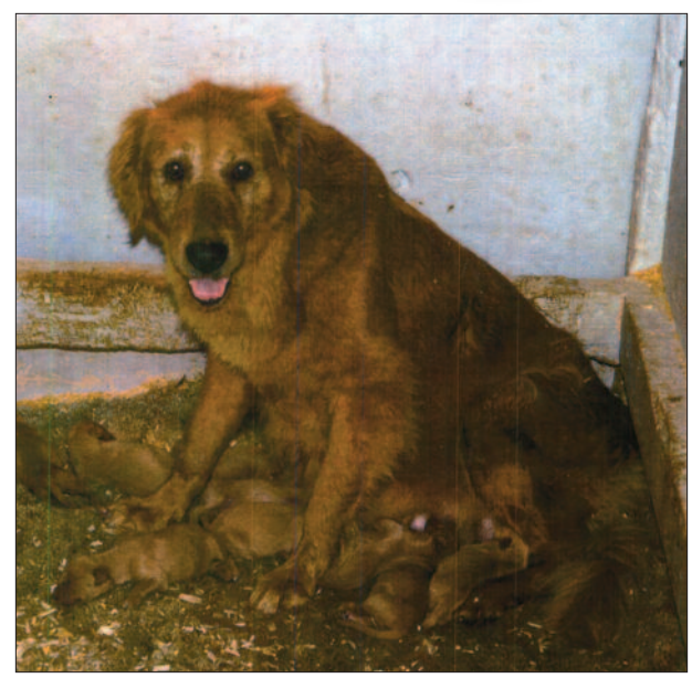
Photo of an older female breeding dog and her litter at Rowell kennel; all animals seized at time of investigation. Lawsuit due to this case.