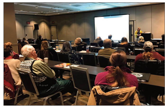
Animal cruelty training held by Animal Folks for Minnesota veterinarians.

• Model Animal Cruelty Policy for Law Enforcement — Throughout 2019, Animal Folks continued our work on a model animal cruelty policy for use by law enforcement in Minnesota. Numerous interviews were conducted with individuals involved with the enforcement of animal cruelty cases, including police chiefs, sheriffs, officers, deputies, a retired judge, prosecutor, veterinarians, animal control officers, and humane agents. These interviews and other research gathered gave us the data needed to draft a model policy. This project continues into 2020 for review, feedback, and approval from authorities.