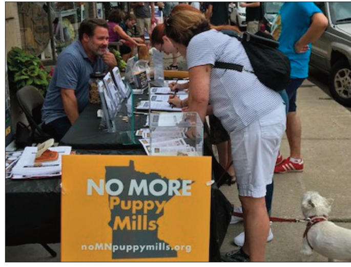
Animal Folks holding a booth on Grand Avenue in St. Paul at Paws on Grand.

Outreach — Animal Folks creates and sends monthly emails to our database as well as making regular posts on Facebook and our website. Emails and posts reflects our research on animal issues. Examples of 2019 topics included review of recent studies of animal sexual abuse; the opioid epidemic relating to use of pet medications by addicts; dogs left unattended in hot cars; state initiatives, such as New York City Council banning fois gras from restaurant menus; and federal laws, such as the Preventing Cruelty and Torture Act (PACT), allowing certain crimes to be charged as felonies. This research is used to generate awareness about general animal cruelty and promote a better understanding of issues in the animal community. In addition to providing information on specific animal topics, our emails and posts also include data on animal cruelty cases occurring throughout Minnesota.