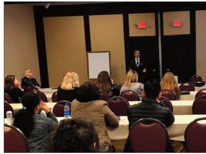
Animal Folks presenting at the OJP Crime and Victimization Conference.