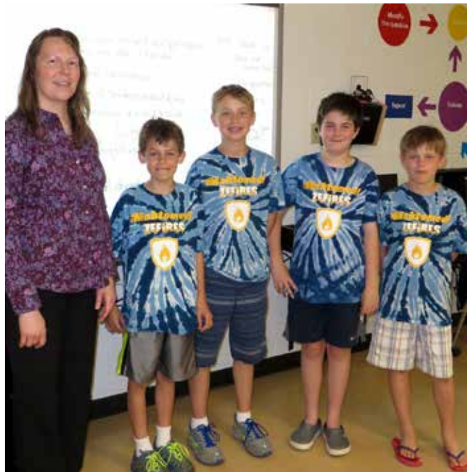
Zefires Lego League 5th Grade inventors