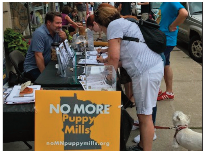
Animal Folks holding a booth on Grand Avenue in St. Paul at Paws on Grand.