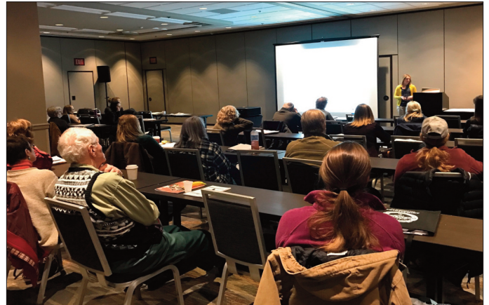
Animal cruelty training held by Animal Folks for Minnesota veterinarians.