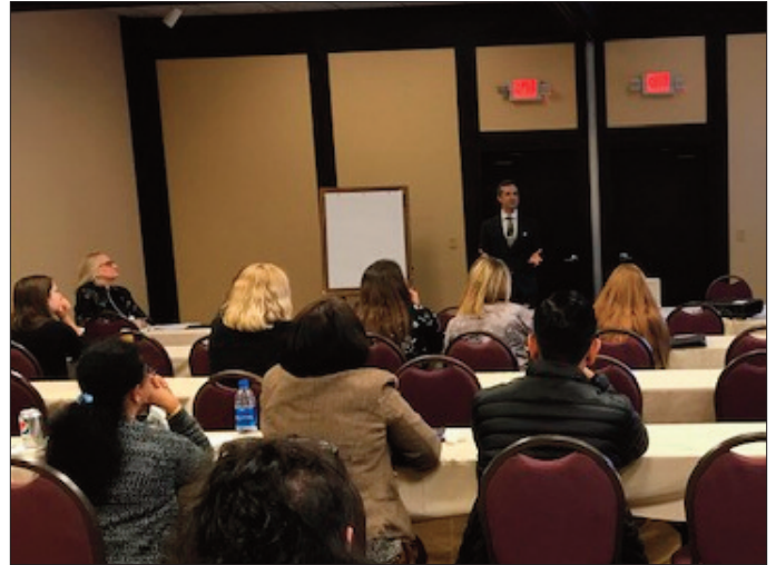
Animal Folks presenting at the OJP Crime and Victimization Conference.